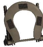
Face Cradle frame