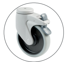
Large Castor Base