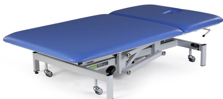
Couch at minimum height

EMS Physio Ltd order codes COU012 Hydraulic with breathing slot COU008 Electric with breathing slot