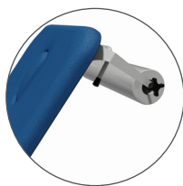
Paper Roll Holder