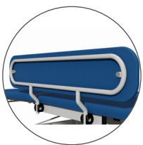
Side Security Rails